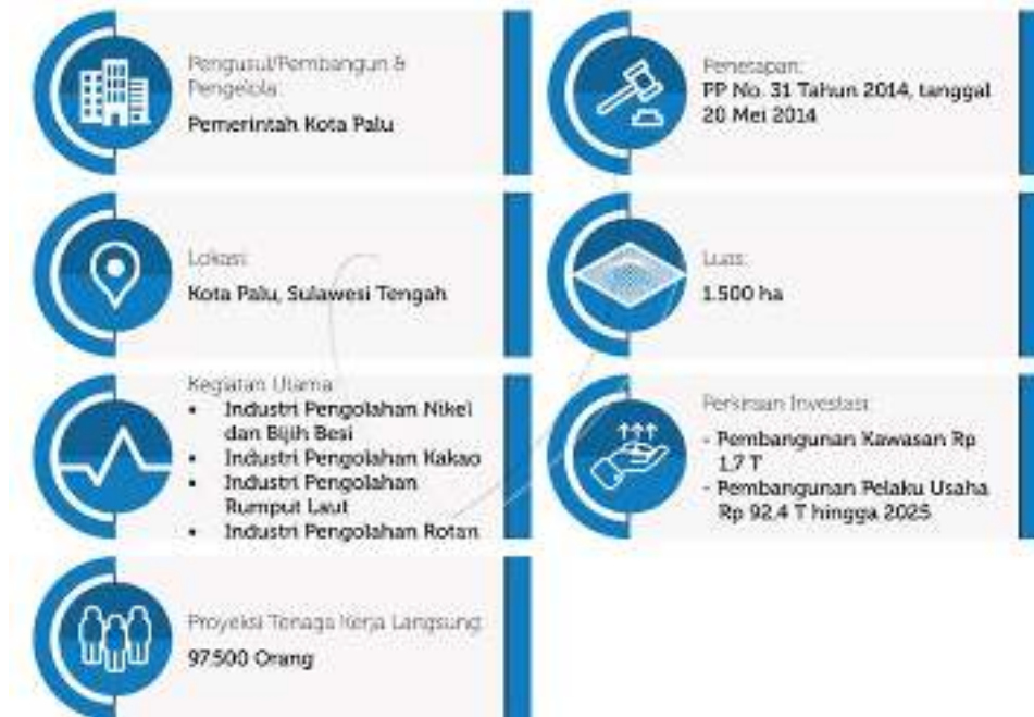
Picture 3. The Profile of Palu Special Economic Zone

The Palu Special Economic Zone focuses on increasing industrial activities. So what is trying to be driven by Palu City Government is an increase in industrial investors. It based on the natural resources of the Central Sulawesi Region which includes marine, plantation and forestry products such as cocoa, seaweed, and rattan.